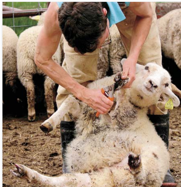
Footrot treatment is time-consuming, expensive and back-breaking work.